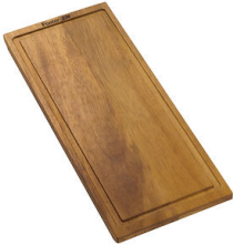
Walnut-wood chopping board 8642 000